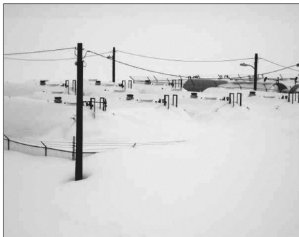
Deep snows blanketed many communities and AVEC's power plant facilities, including this tank farm in Savoonga.

A couple comments made by delegates this year were that AVEC is "all talk and no action" and "they want to see information in writing." We listened and the following is an update on some issues that are shared by our communities.