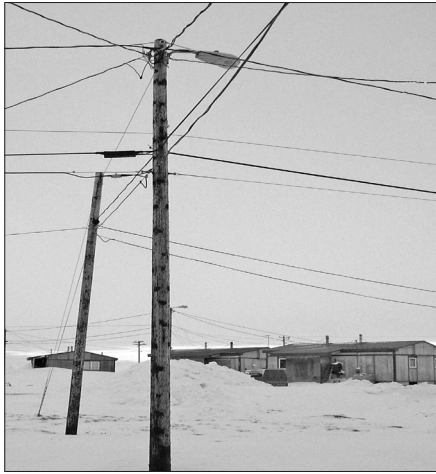
Streetlights are a frequently mentioned topic.

to pursue joint fuel purchases with other entities, like the cities, because of credit issues. A statewide group is trying to help streamline bulk fuel purchases for rural communities to reduce costs.